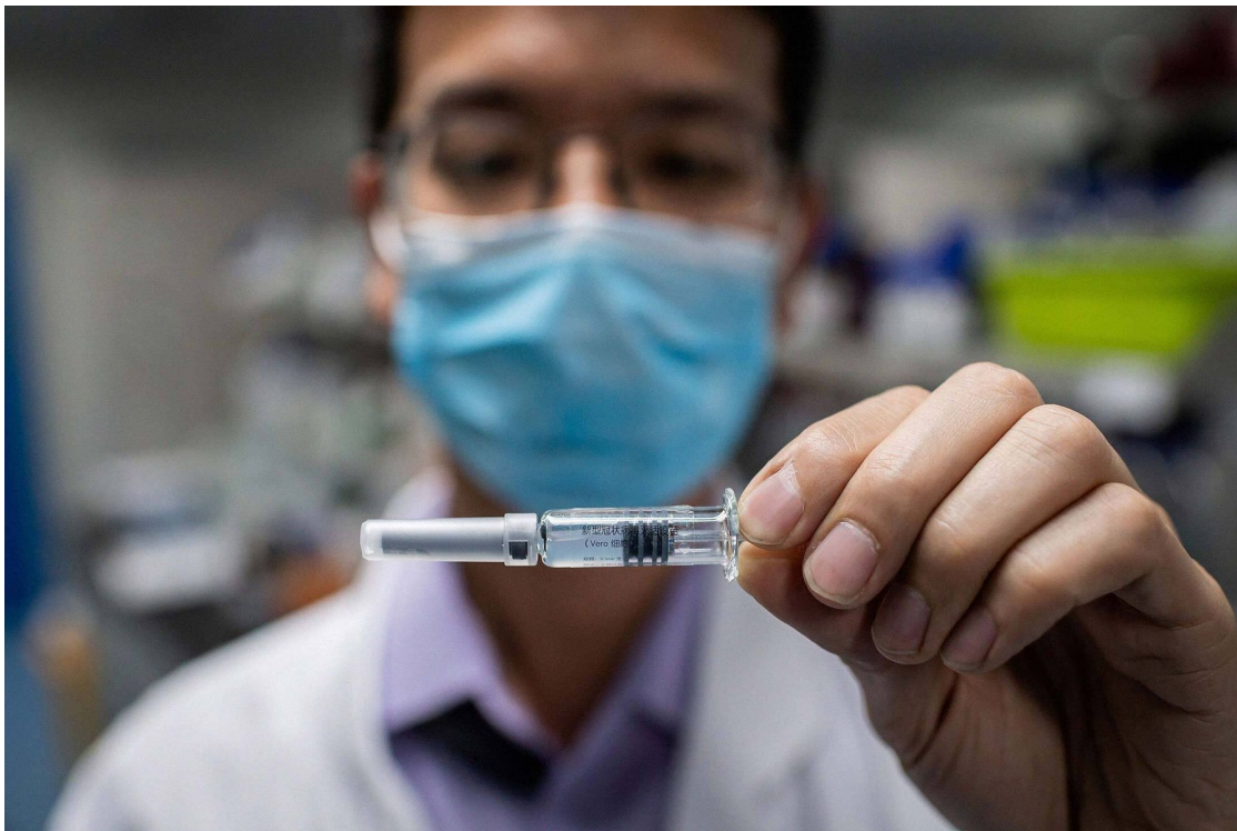
▲ An engineer with an experimental Covid-19 vaccine at Sinovac Biotech's facilities in Beijing on April 29.